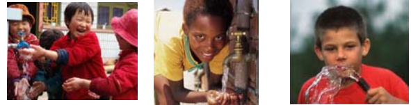
Beijing( Asia) Accra( Africa) Hamburg (Europe)

The SWITCH programme proposes to establish a multidisciplinary learning alliance from the technological to economic groups. The current research emphasizes on financial and economic analysis in the urban water cycle.